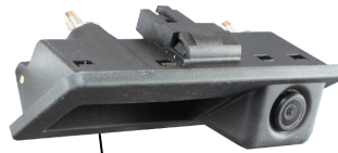
Exchange rear door opener handle with integrated camera (exemplifying figure)