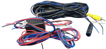
System cable extension with box 7m